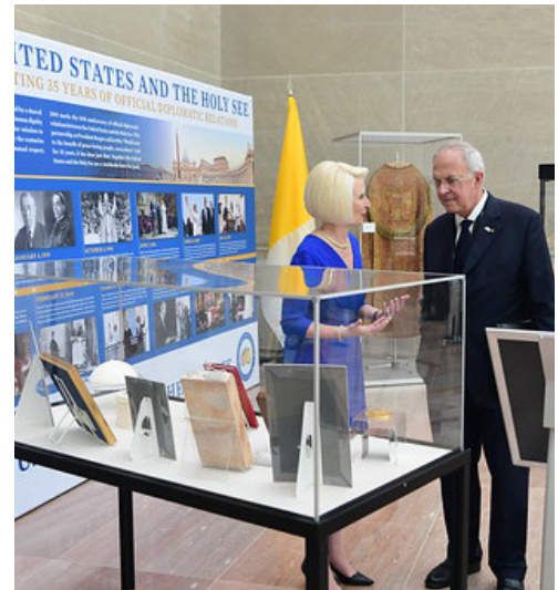
Museum exhibit celebrating 35 years of diplomatic ties with the Holy See, July 17 2019.

The proposed event will be an opportunity to bring the foreign affairs communities of both nations together to celebrate this milestone and formally open the exhibit to visitors of the United States Diplomacy Center. Former ambassadors, current and former foreign and civil service employees, students, and the public will be invited to join for the exhibit's opening with remarks by an expert speaker(s).