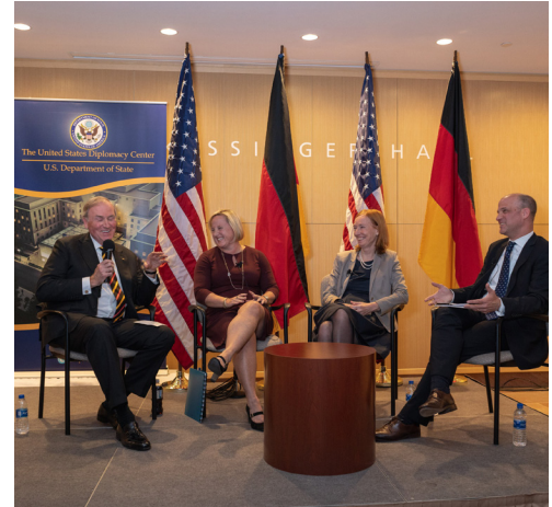
German-American Celebration Panel at the museum, Oct 25, 2018.

The National Museum of American Diplomacy (NMAD), with its unique access to diplomatic history, will be a premier location for conversations centered on diplomacy and foreign affairs. The opportunity to endow a lecture program at NMAD will allow the donor to create a lecture subject of their choosing - either on a geographical or functional basis - related to diplomacy and foreign affairs. Former ambassadors, current and former foreign and civil service employees, students, and the public will be invited to join this annual lecture and the event will entail a special reception at NMAD. The donor will be allowed to invite a portion of the guests and will be acknowledged as the underwriter of the event.