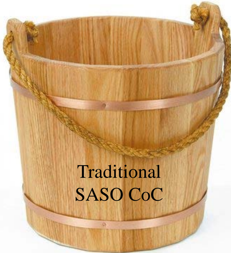
Traditional SASO CoC